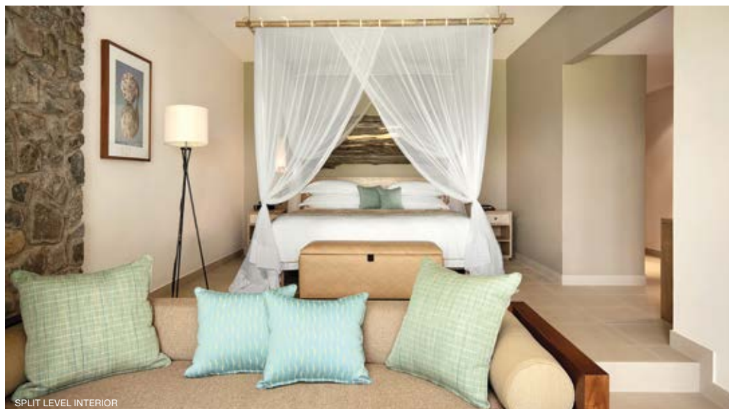
SPLIT LEVEL INTERIOR

A collection of spacious rooms and suites set in expansive tropical grounds, have been designed to blend harmoniously with their spectacular natural surroundings.