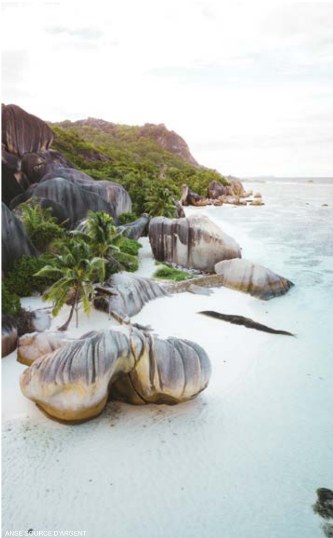
ANSE SOURCE D'ARGENT